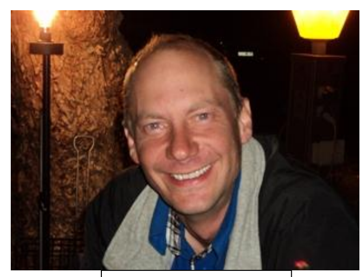
Our SA .303 Champion