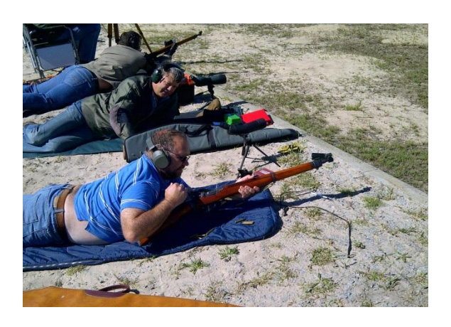
When 300m seems too easy, you can always try 301m...