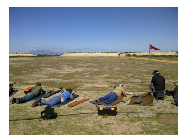
The twitchy wind, bringing many 2's.